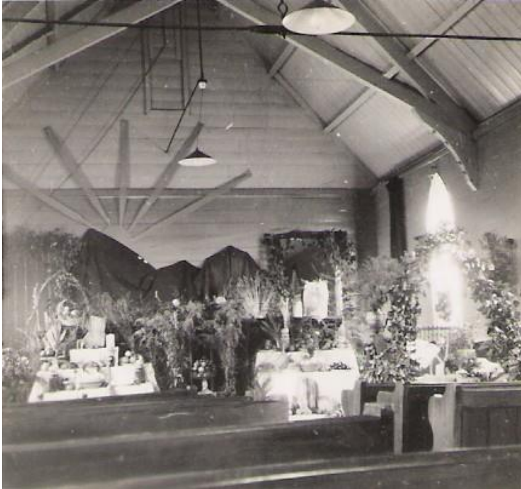
47. Lincoln Baptist Church decorated for Harvest Thanksgiving, mid 1940s.